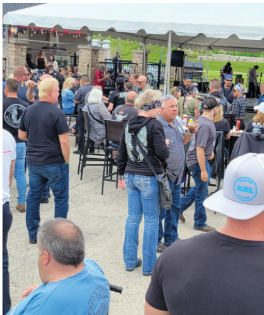
20th Annual BOBSTOCK Biker Bash at Rocky's American Bar & Grill.

Motorcycle Safety Lawyers® was in the house greeting everyone and passing out swag at the 20 th Annual BOBSTOCK Biker Bash on Sunday, June 12, 2022. Known as Chicagoland's Best Biker Bash of the Summer, the day was filled with live bands, vendors, and plenty to eat and drink. Rocky's American Bar & Grill was the host, located at 698 Milwaukee Ave in Prospect Heights, IL. The ride started at Rocky's with stops at Chasers Lake Zurich, Woodfire Tavern in Long Grove and then back to Rocky's, where the music and the party continued well into the evening.