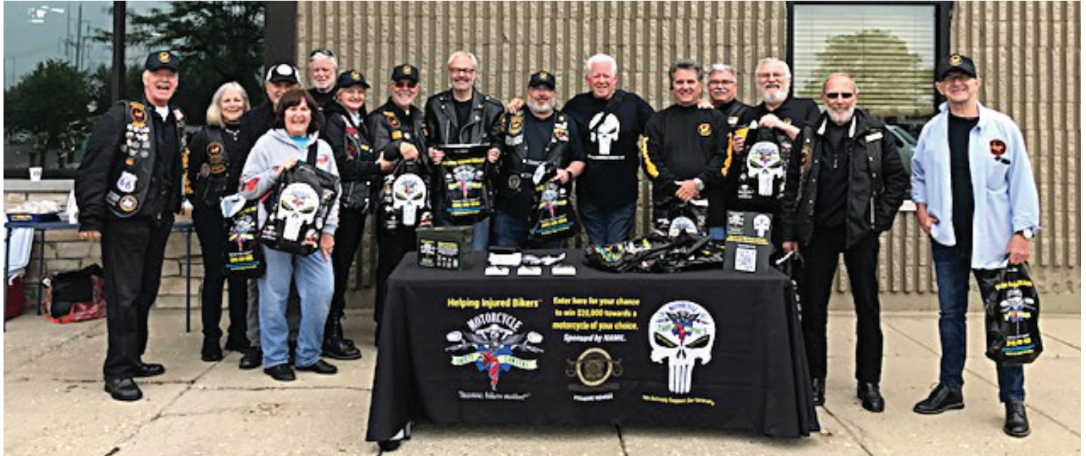
Top Cats 25th Annual "Ride For Dreams"

All bikes were welcome at the 25 th Annual Ride for Dreams held on June 12, 2022. The ride started at Woodstock Harley Davidson, KSU at 10:30 am and ended at the Volo Auto Museum. All registered bikes enjoyed a ½ price ticket to the Volo Auto Museum and/or Jurassic Park exhibit. Proceeds from the ride benefit NISRA.org (Northern Illinois Special Recreation Association). They provide year-round recreation activities for people with disabilities.