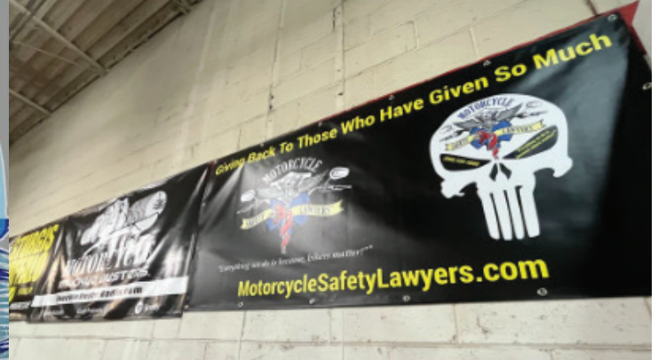
Motorcycle Safety Lawyers® is happy to support this worthy cause.