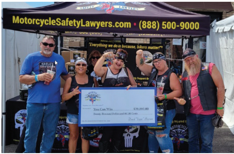
Everybody wants to sign up to win $20K toward the motorcycle of their choice.