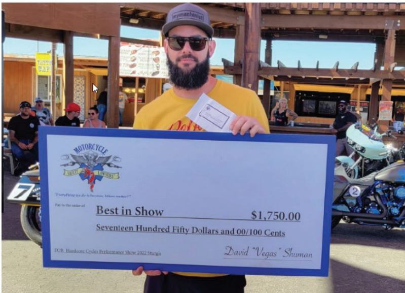
Best in Show Winner of the Hardcore Cycle Performance Bike Show Sponsored by Motorcycle Safety Lawyers®