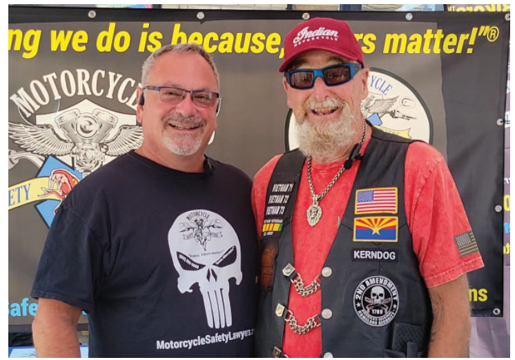
Another satisfied Motorcycle Safety Lawyers® National Biker VIP Card™ Holder