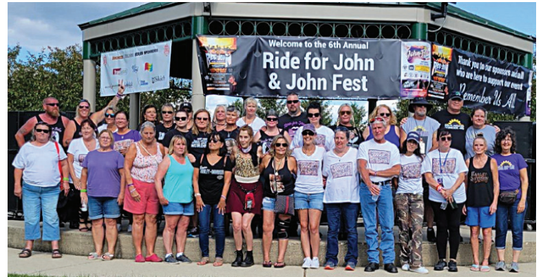
My Child's Life Matters stands with parents that have lost their children to Opiates and Fentanyl