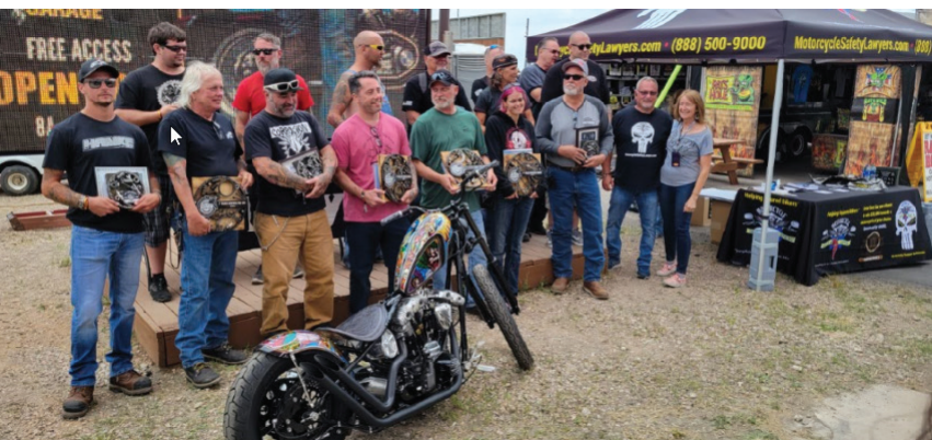
Winners of the Schools Out Chopper Show Sponsored by Motorcycle Safety Lawyers®

MSL also handed out 2000+ Swag Bags between both booth locations and signed up over 1000 entries for a chance to win $20,000 for the bike of your choice at a drawing to be held in November.