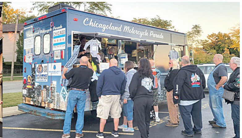
The Toys for Tots Truck Sells Shirts, Hoodies and more at the North Side Kick-Off Party