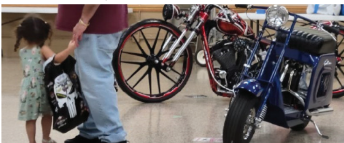
Everyone Loves Motorcycle Safety Lawyers® Swag