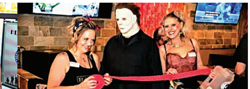
Even Michael Myers wanted to buy a raffle ticket at the party!