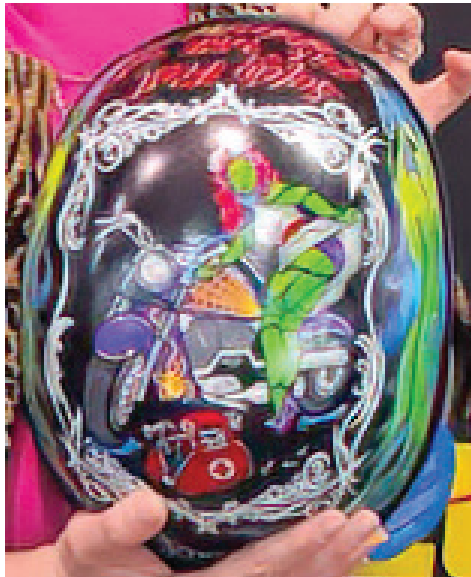
This helmet raised $25,000 at the Mecum Auction!