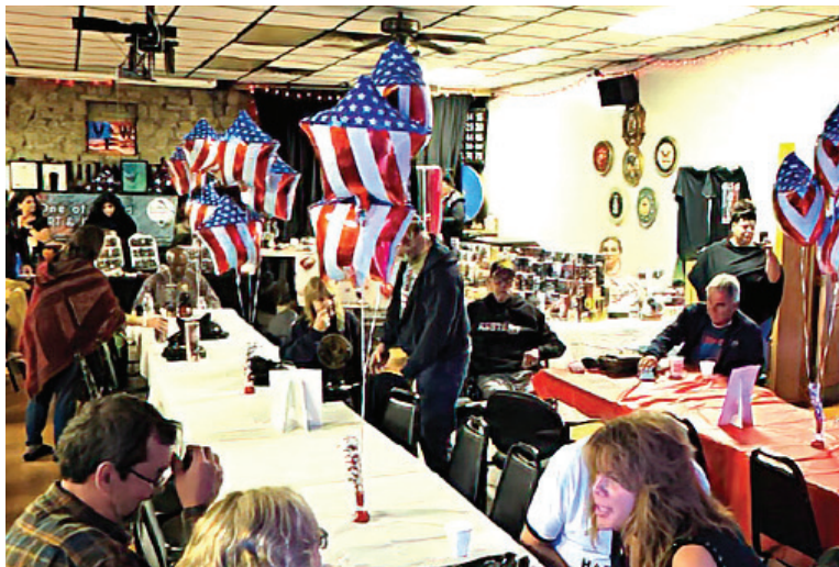
It was a packed house for the 2nd Annual Support Our American Military Vets event

Enter To Win $20,000 Toward A Motorcycle of Your Choice! Scan The QR Code To Enter