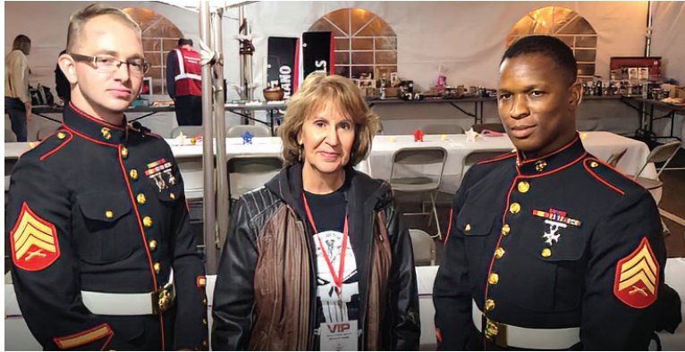
Marine Sergeants supporting the Veterans at the BBQ

In the military, Zero Hundred Hours signifies a new day, and Mission Zero Hundred Hours is the start of a new day, and a new beginning for many Veterans. Motorcycle Safety Lawyers® was proud to participate and be a sponsor for this worthwhile program and all that it does to support Veterans.