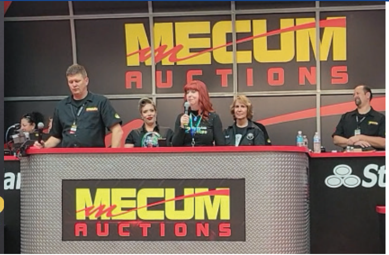
Mecum Auto Auction, Las Vegas, NV

The first group of custom helmet designs were presented to the public at the Mecum Car Auction held on November 10-12 at the Las Vegas Convention Center in Las Vegas, NV. Each of the artists used their unique talents to create a custom design and paint it on a KIRSH Helmet. A few of the artists even came down to the event to see their helmets on display.