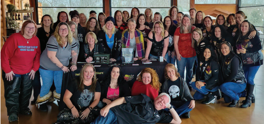
PONO Holiday Party