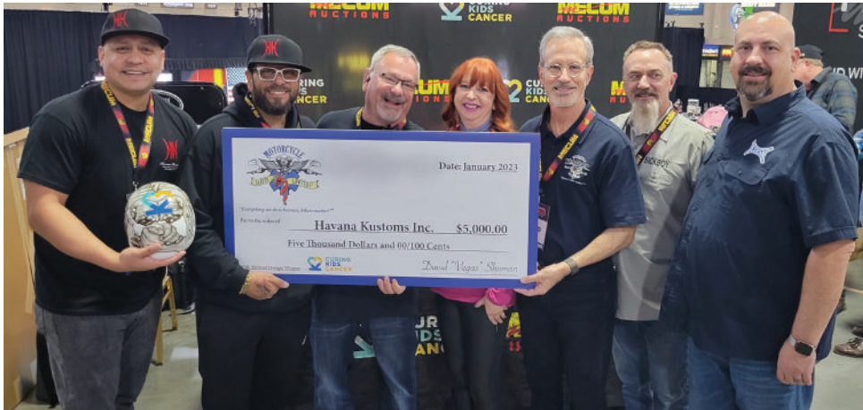
Motorcycle Safety Lawyers® presents the $5000 check to Havana Kustoms

KIRSH Helmets will produce the winning helmet design, and the winner was presented with a check for $5,000 from Motorcycle Safety Lawyers® !