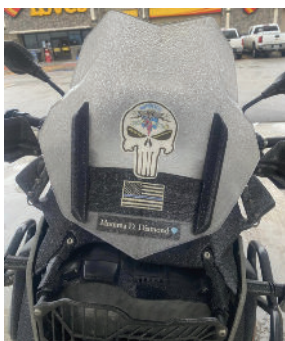
Riding through an ice storm!