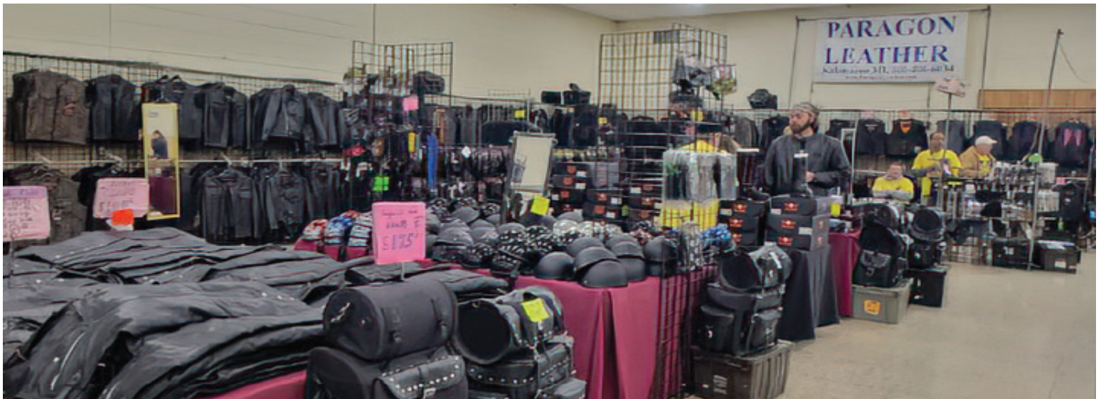
A wide selection of leather good available by Paragon Leather

Once again, you'll find Motorcycle Safety Lawyers® (MSL) supporting the biker community by sponsoring and exhibiting at the Peotone Swap Meet on Sunday January 15th. Everyone that attended was given a FREE swag bag full of goodies, courtesy of MSL. It was a packed crowd for this indoor gathering with plenty of new and used motorcycle parts, jewelry, vintage signs, posters, knives, leather goods and more. There's always something new to see at the Peotone Swap Meet! Mark your calendar for the next one, on Sunday, May 7th.