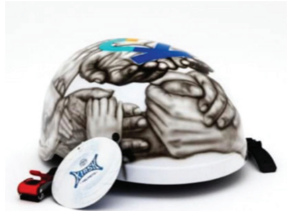
Winning helmet design

We would like to thank all the artists who generously gave their valuable time and talents for this great cause. The helmets will continue to be auctioned at MECUM Auctions throughout 2023.