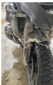
MAGIC covered in ice