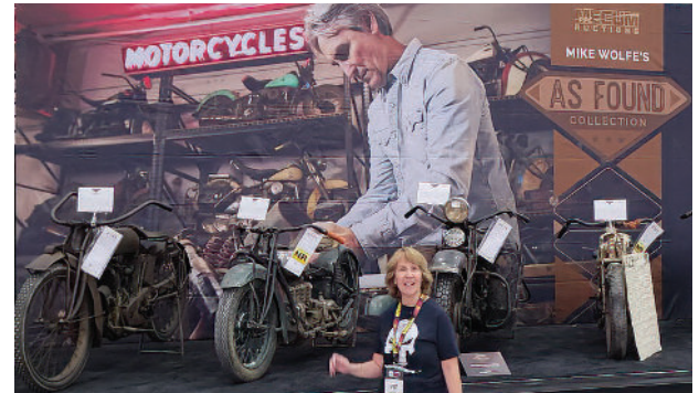
Part of Mike Wolfe's private collection was auctioned off at MECUM

But the story gets even better. The helmet was packaged up and ready to be delivered to Mike. Mike responded that he believes in what Curing Kids Cancer is doing, he wants to support their efforts, and that Curing Kids Cancer could make even more money if he gave the helmet back so it could be auctioned again!