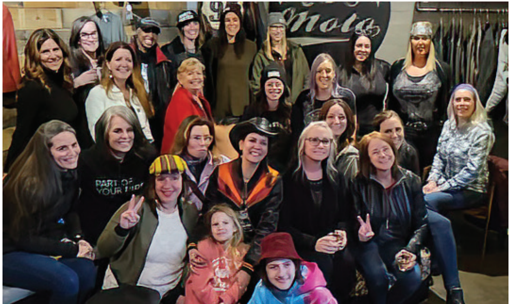
Main Street Moto AIMExpo After Party