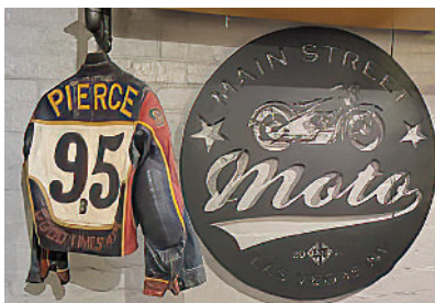
Dennis Pierce Racing Jacket at Main Street Moto