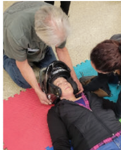
Learn when and how to remove a helmet