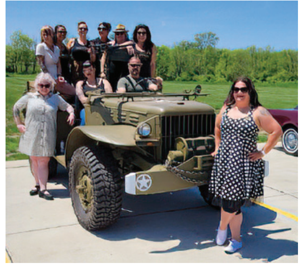
Battle Betties Chrome Cruise In For Heroes 1 st Place Winner