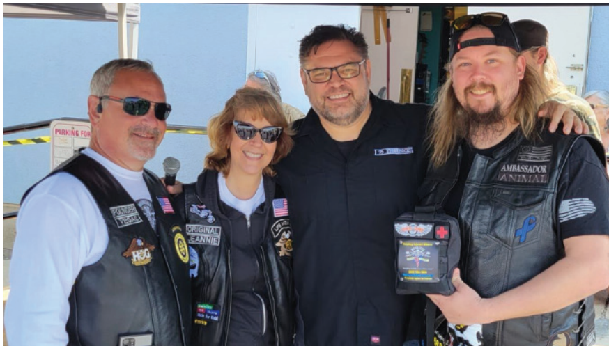
Trauma Packs were awarded all day!