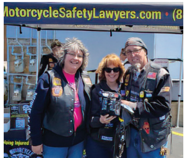
Another Trauma Pack Winner!