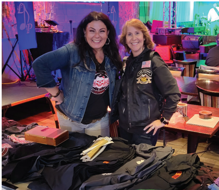
21 st Annual BOBSTOCK Biker Bash at Rocky's American Grill

The 21 st Annual BOBSTOCK took place on Sunday, June 11, 2023. The ride started at Korner House Bar and Grill in Elk Grove Village, IL at 11:00 am, rode out to Donkey Inn in Palatine, and headed back to Rocky's American Grill in Prospect Heights, IL for the after party at 3:00 pm.