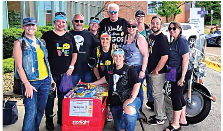
Motorcycle Safety Lawyers® and PONO Lady Riders Supporting Bricks of Hope™ in delivering 200 LEGO sets!