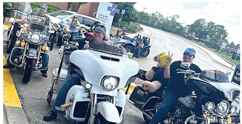
PONO Lady Riders Motorcycle Parade