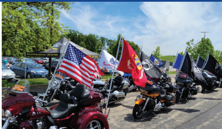
Rolling Thunder Chapters 1, 2, & 3 Rode for the POW/MIA