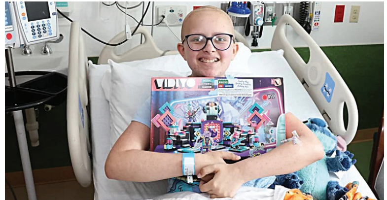
Delivery at Lurie Children's Hospital brings "miles of smiles"