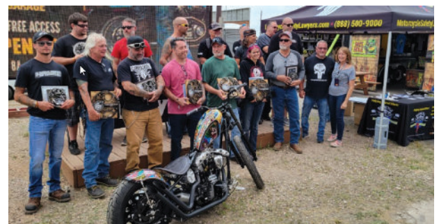
2022 Winners of the Schools Out Chopper Show Sponsored by Motorcycle Safety Lawyers®