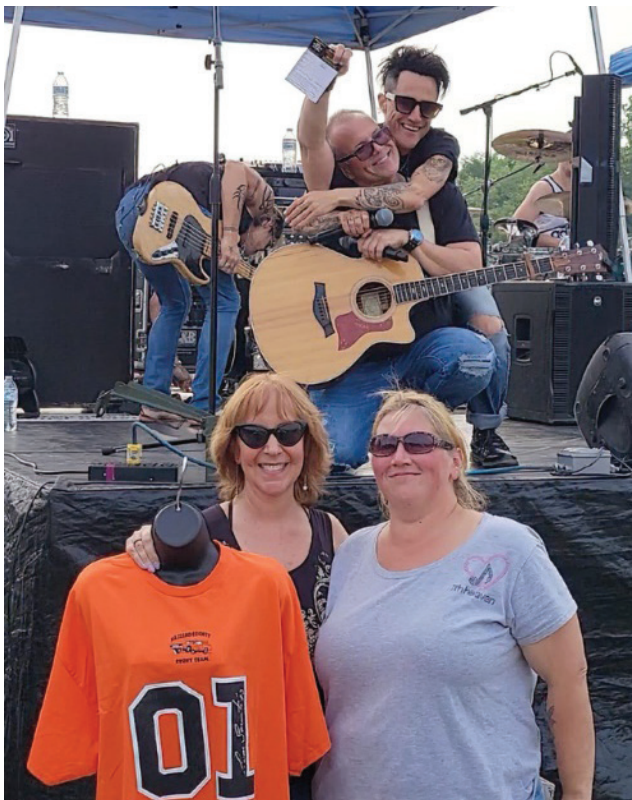
Winner of the General Lee Shirt