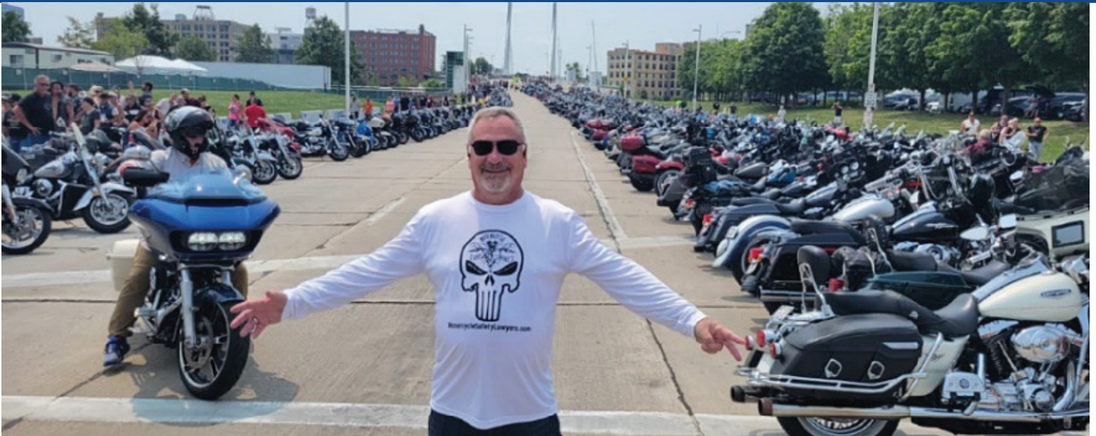
There were bikes parked as far as the eye could see!

Hundreds of thousands of H-D fans and motorcycle enthusiasts gathered from around the world to attend Harley-Davidson's 120 th Celebration . There were over 130,000 attendees over the four-day event with people coming from as far as Germany, Russia, and the Czech Republic. They all own Harleys and feel connected by the brotherhood of Harley-Davidson (H-D) motorcycles. Everyone was happy, smiling, and friendly. The mood was good, the music was great, and the motorcycles were there in record numbers.