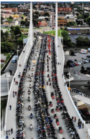
The bridge became a parking lot for bikes.

The 4-day festival concluded with the 5-mile long, Harley-Davidson 120 th Anniversary Motorcycle Parade which left from American Family Field and traveled through the heart of downtown Milwaukee. 7,000 motorcycles participated in the parade!