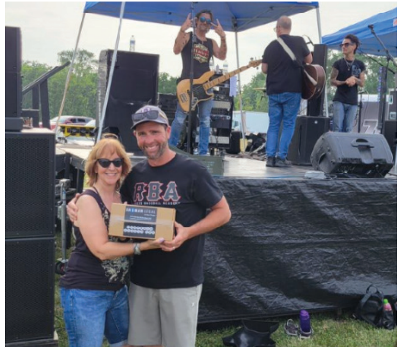
Winner of the Roadside Assistance Kit