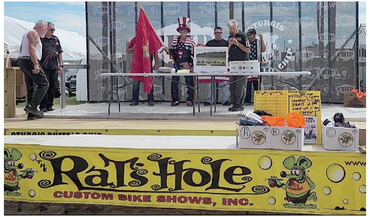
Rat's Hole Custom Bike Show