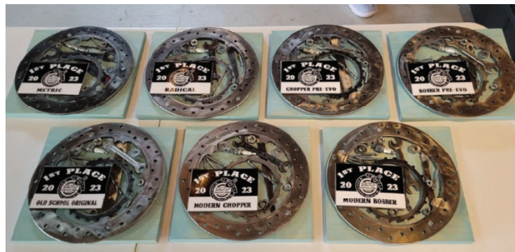
Schools Out Chopper Show 1 st Place Trophies crafted by Dana at Metalwork Garage