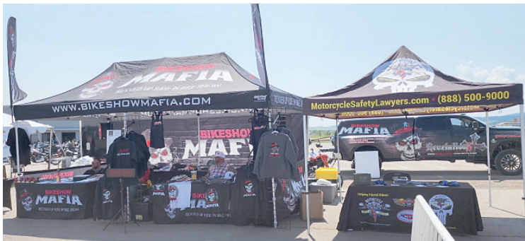
Bike Show Mafia All Class Bike Show