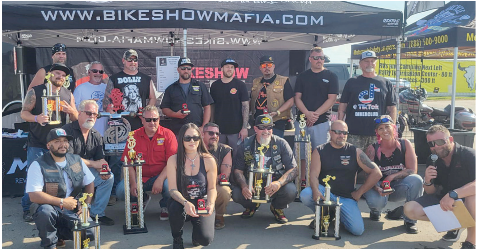
Winners of the Bike Show Mafia All Class Bike Show