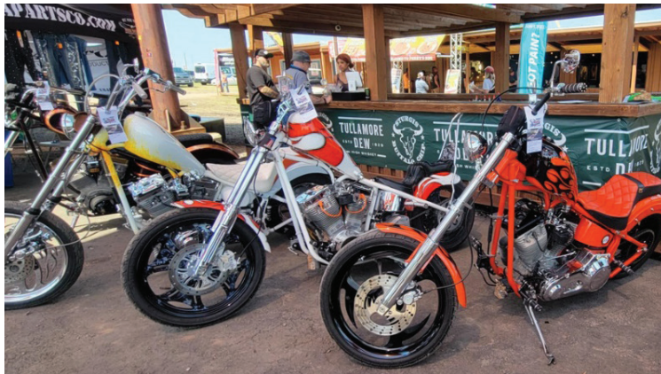
Evo Entanglement Bike Show