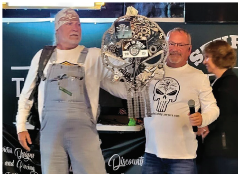
Winner of the Best in Show Trophy and $2500 Cash Sponsored By Motorcycle Safety Lawyers® at the Schools Out Chopper Show