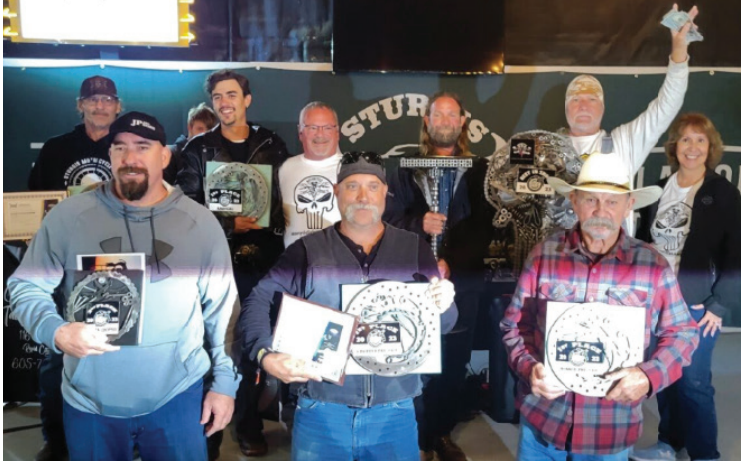
1st Place Winners in each of their categories received a trophy and $500 cash sponsored by Motorcycle Safety Lawyers® at the Schools Out Chopper Show