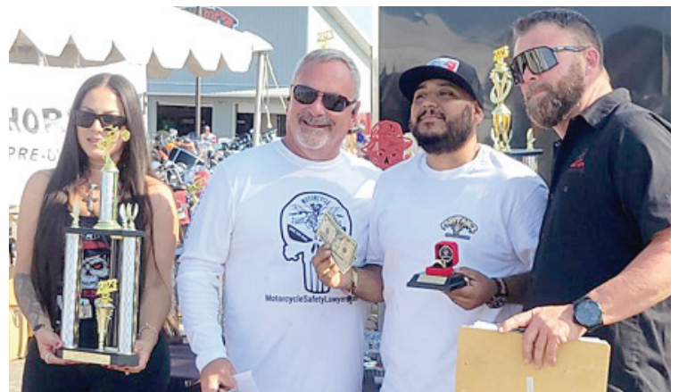
Winner of cash prize (by MSL) at the Bike Show Mafia Bike Show