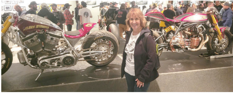
Motorcycles as Art Exhibit at the Sturgis Buffalo Chip Event Center