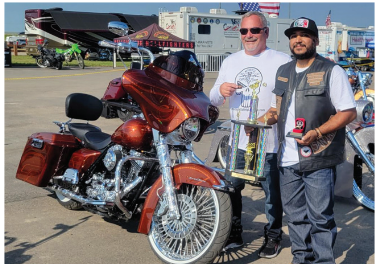
Winner of trophy in Bike Show Mafia Bike Show