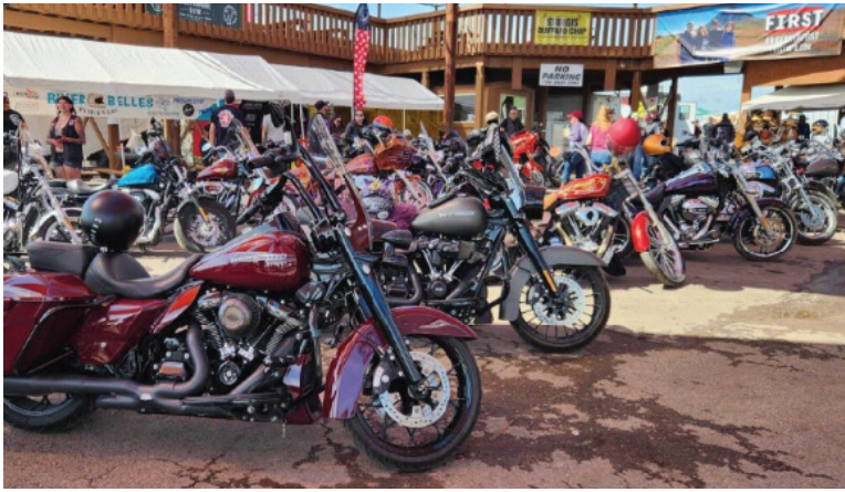
Bike Belles Bike Show