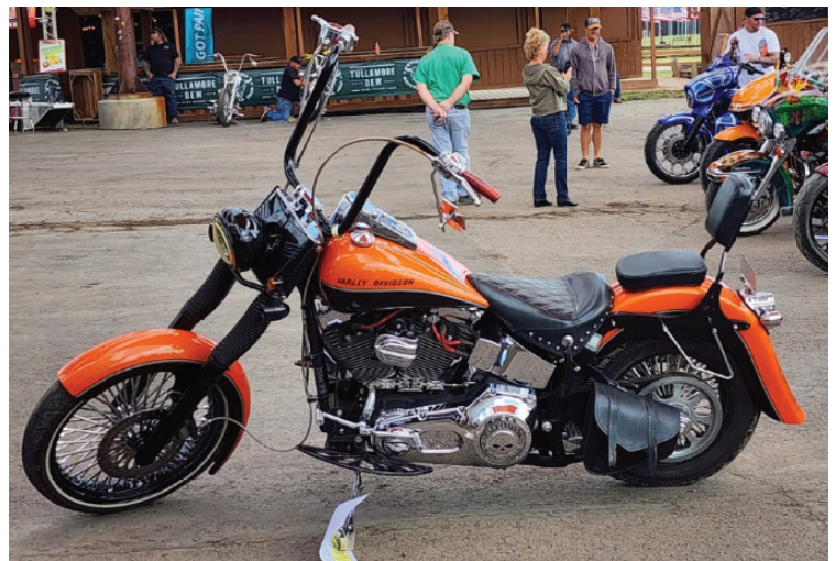
Rat's Hole Custom Bike Show