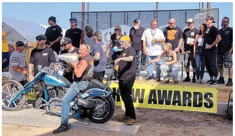
Evo Entanglement Bike Show Winners