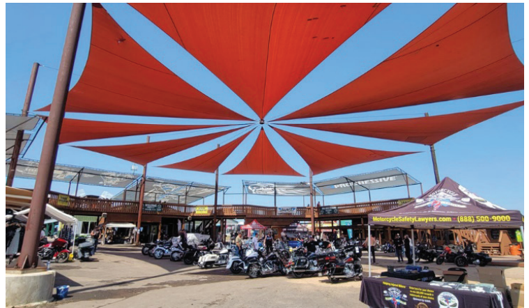
Evo Entanglement Bike Show