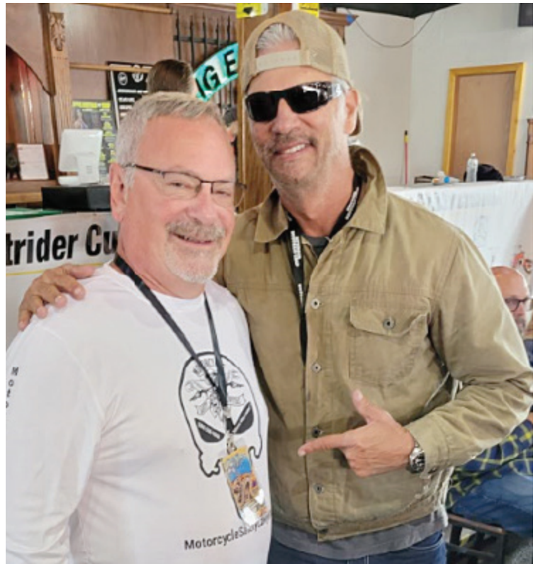
"Vegas" with Lorenzo Lamas