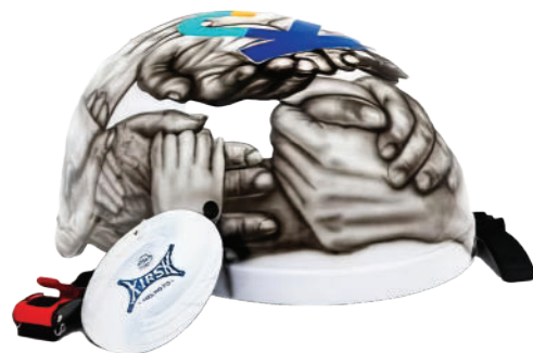
The "winning" Kirsh helmet will be auctioned off at the Mecum Motorcycles Auction January 24-27, 2024

Every 33 minutes, a child in the U.S. is diagnosed with cancer. This one-of-a-kind fundraising event was designed to bring awareness and raise money for childhood cancer research. The FINAL "winning" Kirsh helmet from the Art from the Heart campaign will be auctioned off at the Mecum Las Vegas Motorcycles Auction January 24-27, 2024 . You do not need to be present to bid on the winning helmet, you can be an online bidder. Hop online and bid on this helmet to help save a child's life. Visit Mecum.com for more information.