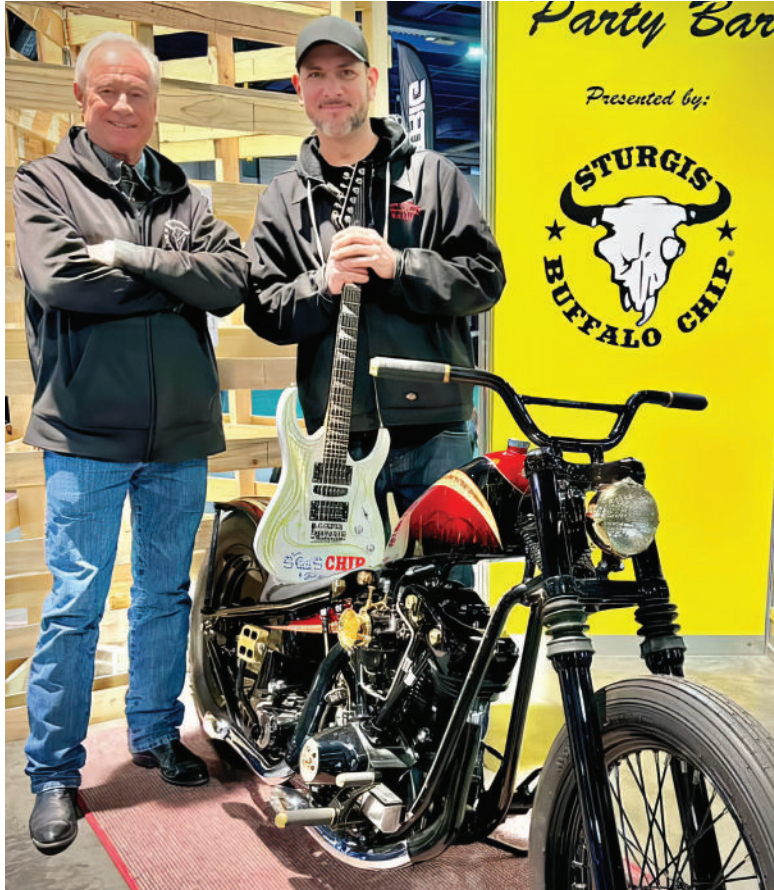
The Winner of the “Spirit of the Chip” Trophy

Motorcycle Safety Lawyers® looks forward to seeing everyone at The Buffalo Chip this year for the Sturgis Rally.