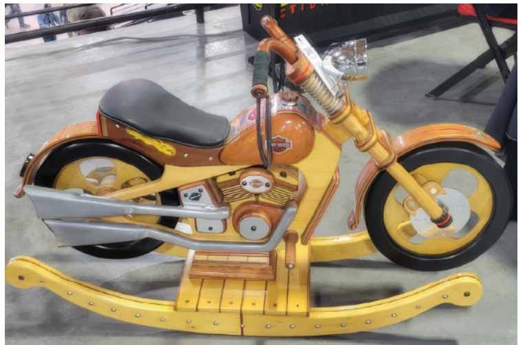
An audience favorite donated to support Curing Kids Cancer