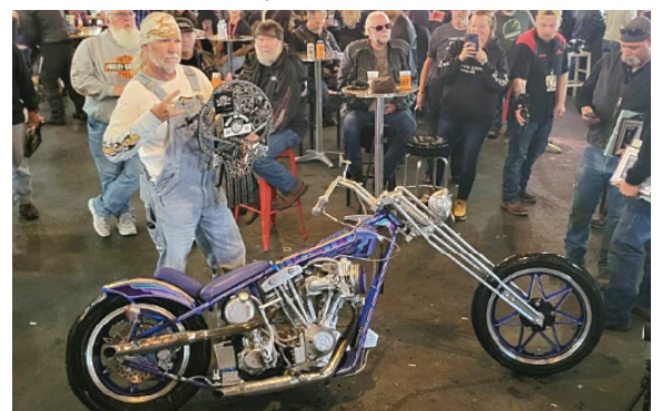
Sturgis Schools Out Chopper Show "Best in Show" Winner