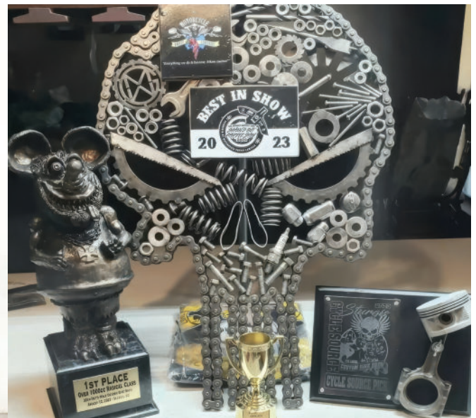
A few of the many awards this chopper has won!