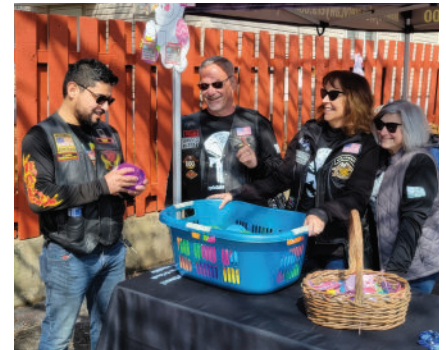
MSL had Easter Eggs for the Adults with Fabulous Prizes