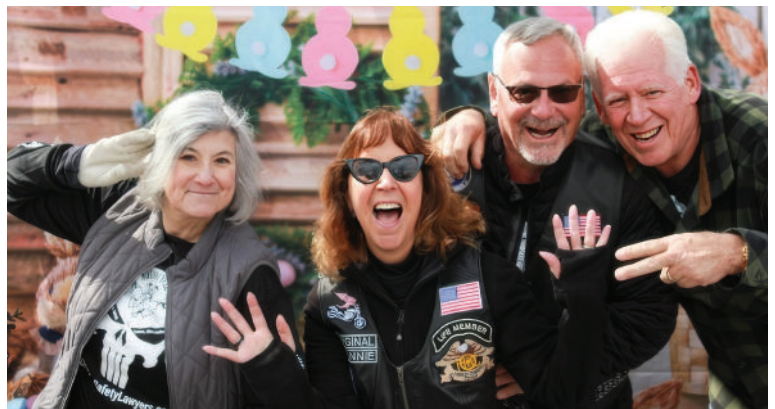
We had a great time. Thanks for having us!