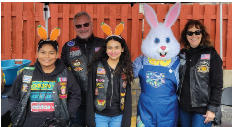
Of course, the Easter Bunny was there!