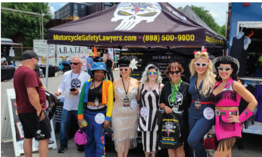
Some of the Motoblot Pin-Up Contest Contestants