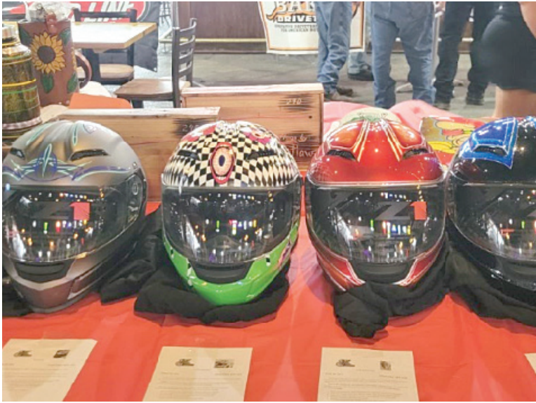
Paint Slinger Shootout Presented by ZR1 Helmets