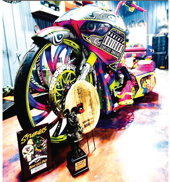
Motorcycle Safety Lawyers® Pick at The Rat's Hole