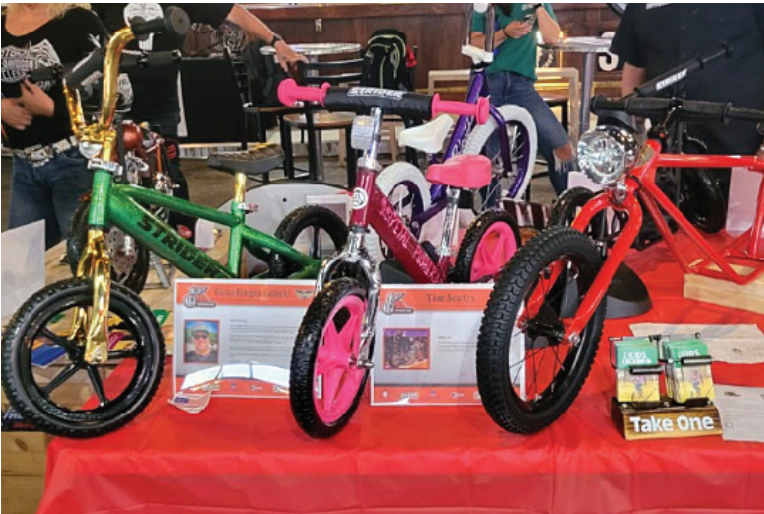
Tiny Strider Custom Bikes