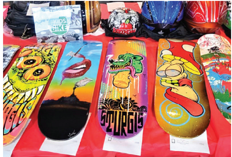
Art On Deck Presented By Gnarly Magazine