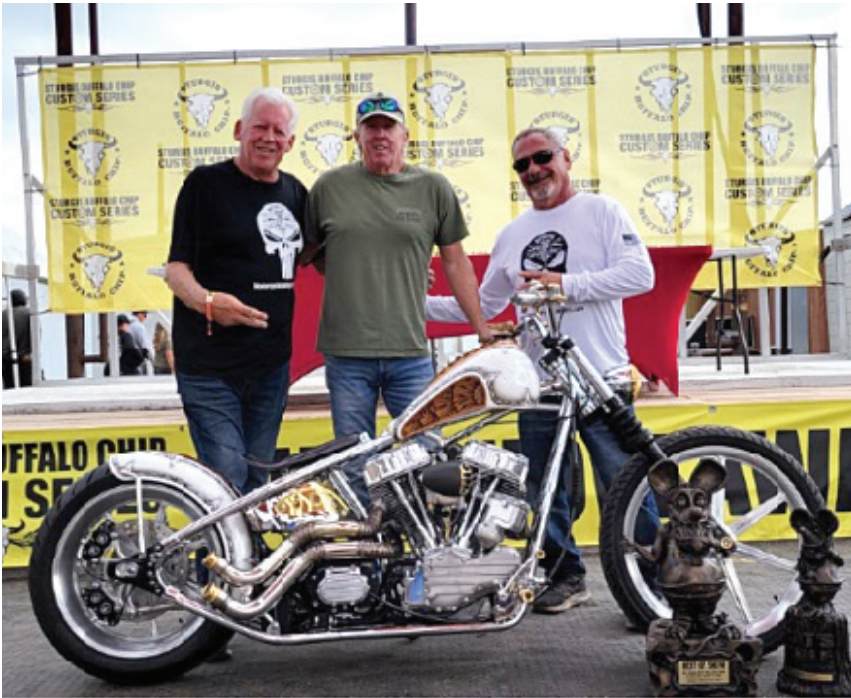
The Rat's Hole Best of Show Winner!