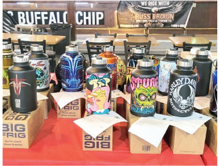
Drink The Art Presented by Big Frig