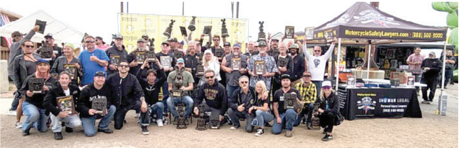
The Rat's Hole Winners at the Buffalo Chip

MSL was excited to spend the week at the Sturgis Buffalo Chip and meet all the bikers, see all the cool and unique motorcycles, and hand out FREE Swag to everyone.