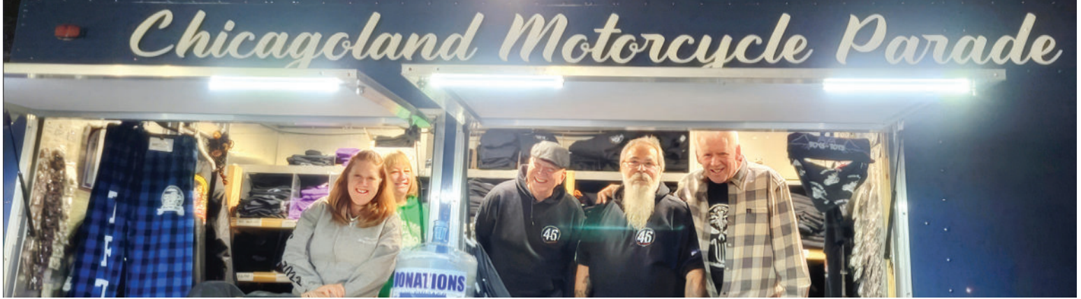
The Toys for Tots Truck will be there selling Shirts, Hoodies, and more!

MSL is happy to support and participate in this annual event for such a worthy cause.