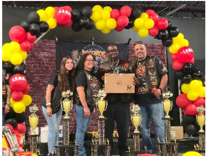
MSL also sponsored the trophies and donated a Chromebook laptop to this lucky winner!