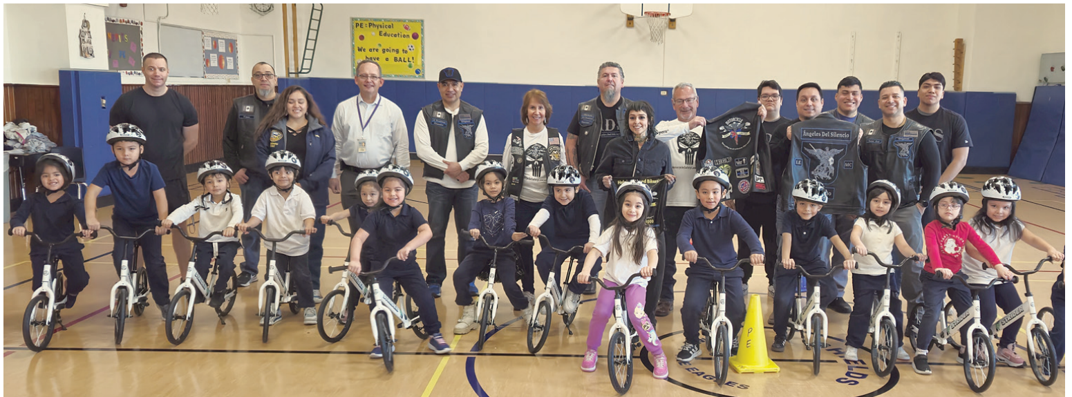
2025 All Kids Bike Recipients from James Shields Elementary School

Supported by the Strider Education Foundation, All Kids Bike Kindergarten PE Learn-to-Ride Programs are active in over 1,784 schools across all 50 states, teaching more than 178,400 kids to ride each year and over 1,784,000 kids throughout the 10-year lifespan of the programs already in place. For more information, please visit www.allkidsbike.org .