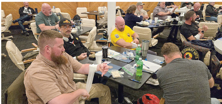
Wrapping an injury