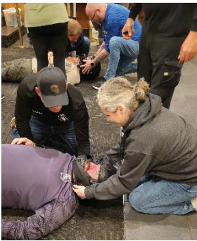
Learn when and how to remove a helmet